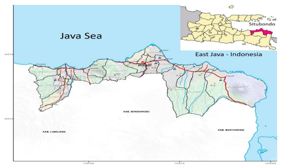
Figure 1. Map of Situbondo region, East Java, Indonesia

Primary Data for this study were obtained from backyard hatchery activities operated in Situbondo region, East Java, Indonesia from January to December 2017 and the seconder data were obtained from published articles, scientific reports and journals. The terms of "backyard" presented in this paper refer to the systems and activities consist with broodstock management activities, hatchery and early nursery phase to produce tiger grouper fingerlings with average length around 8 - 9 cm or known as complete hatchery system with profit-making purposes. Cost and return analysis was carried out to investigate the profitability of enterprises involve the use of capital investment, operating expenses and sales during two production cycle in one year production system.